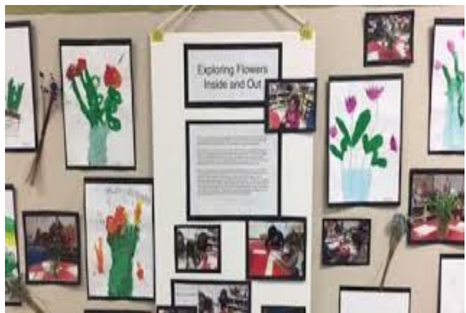
Display boards and set ups!